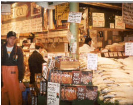
Pike Place Fish Market, Seattle, WA

Be sure to check out the Iowa Chapter's website at http://www.cpcu-iowa.org for updates on the meetings, directors, officers, and chairs list, past ChapterGrams and other news.